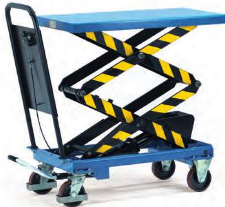
6836 | 6837