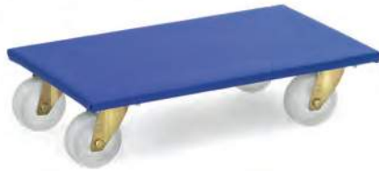
2350 | 2352

Two steering wheels with non-marking polyurethane tyres and non-tracking elasticated solid rubber tyres, hub with roller bearings. One fixed 5 m long strap. Delivered in pairs.