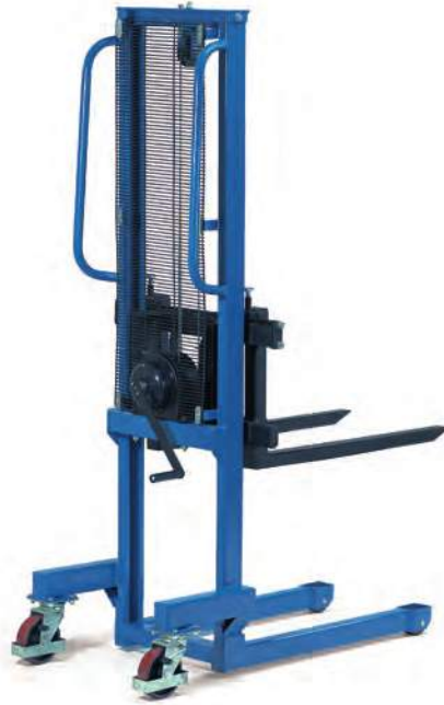
6851 | 6852

Maintenance free. Lifting by means of safety hand winch. Forks adjustable. 2 castor wheels, wheels with polyurethane tyres 150 x 40 mm and 2 fork rollers nylon 80 x 47 mm. Castor wheels with lock. Load center distance: 400/500 mm Fork width: 60 mm Stroke per crank turning: 40/22 mm