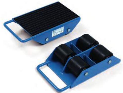
6944 Transport roller