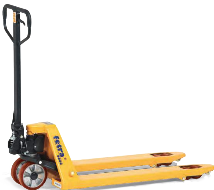
2115 | 2116 | 2117 | 2119