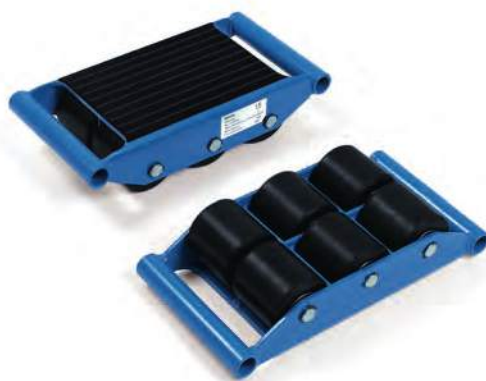
6945 Transport roller