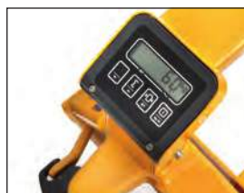
Pallet truck with scale