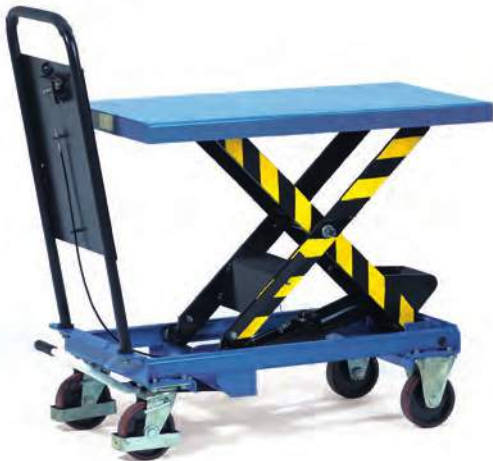
6833 | 6834 | 6835