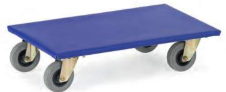
2351 | 2353