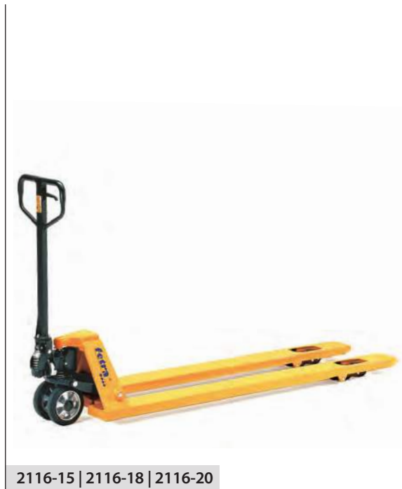
2116-15 | 2116-18 | 2116-20