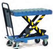
Roller conveyor with attachable frame.