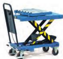
Roller conveyor with live ring.