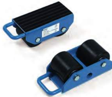
6943 Transport roller

For the easy and safe transport of heavy goods such as containers, boxes, machines etc. Sturdy welded steel construction with handles made of round or tubular steel, powder coated blue RAL 5007. Carrying platforms with anti-slip rubber cover. Big nylon rolls with roller bearings. High carrying capacity combined with low net weight.