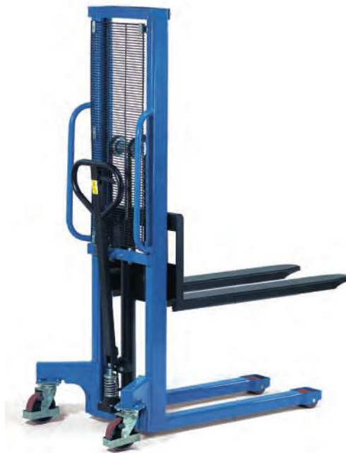
6855 | 6856

Hydraulic pump with chromium-plated piston and overload valve. Operated via drawing shaft. Lowering valve precisely adjustable via hand lever. 2 castor wheels, wheels with polyurethane tyres 150 x 40 mm and 2 fork rollers nylon 80 x 70 mm. Castor wheels with lock. Load center distance: 585 mm Fork width: 160 mm Stroke per shaft operation: 20/12.5 mm